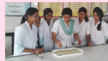
Animal Sci. & Dairy Science Lab