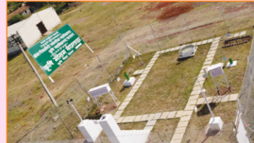
Agro - Meteorology Observatory

FACILITY OF FILLING ONLINE APPLICATION FOR MANAGEMENT QUOTA IS AVAILABLE AT COLLEGE