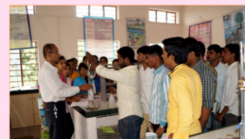
Soil Science & Agril. Chemistry Lab