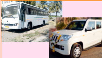
College Bus & Jeep