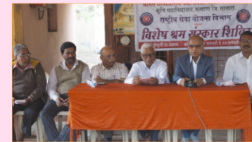
N. S. S.