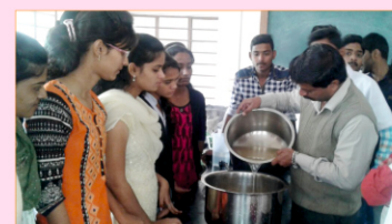
Post Harvest Tech. Lab