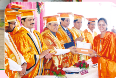
University Silver Medalist Horticulture Student